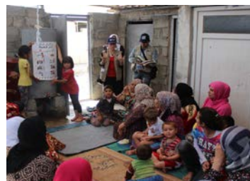
Sessions for the water conservation campaign in Erbil Governorate.

In camps in Jordan and Iraq, considerable investment continues in long-term piped networks and water management systems in the camps to reduce costs through transition to more cost-effective systems. However, as the establishment of these systems is a major infrastructure undertaking, water trucking and desludging continues in several camps particularly where water yields are insufficient, in transit areas and in areas with high water salinity. WASH partners are also focused on improving other services in camps including improved household access to family latrines and showers, water quality monitoring, waste water and solid waste management, and community mobilization and participation.