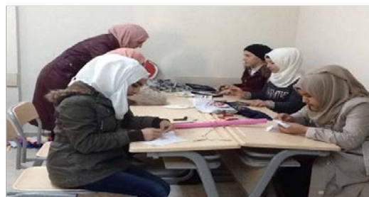
Knitting and sewing/embroidery course at the SSG community centre in Antakya, Hatay.

In Egypt, a workshop was organized for partners on field orientation and urban profiling, focusing on economic activities of refugees and livelihood opportunities.