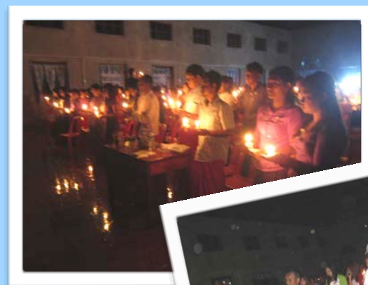
The participants lighted up candles to commemorate the women who have been victims of violence around the world.

The event was closed with a candlelight vigil to commemorate the women who have been victims of violence around the world.