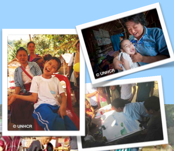
Celebrations and traditional performances

“ But for me, the day is not about celebrating disability, but instead, about celebrating all that is possible for people with disabilities, their abilities, and all that they are capable of...”