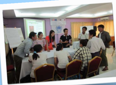
Group Discussion in Durable Solution workshop for the staff from agencies in Kayin State (12 December)

Key issues which came up during the workshops included questions about the link between the peace process and refugee return, the understanding of humanitarian principles and the tension between managing a return process and respecting freedom of choice. Participants expressed interest in knowing more about the experience of other countries and asked that further workshops be held at the township level on a more detailed, planning basis.