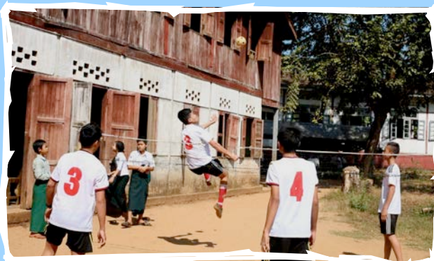
Distribution of Sport's equipment by the International Olympic Committee and UNHCR.

Among the guests present at the hand-over ceremonies last week were Sports Ministry officials also representing the Myanmar National Olympic Committee, representatives from the Ministry for the Progress of Border Areas and National Races and Development Affairs (NaTaLa), local dignitaries and authorities, and the headmasters of all the beneficiary schools. Two Myanmar gold medalists from the SEA Games were also present to share their passion for sport and to encourage the youth.