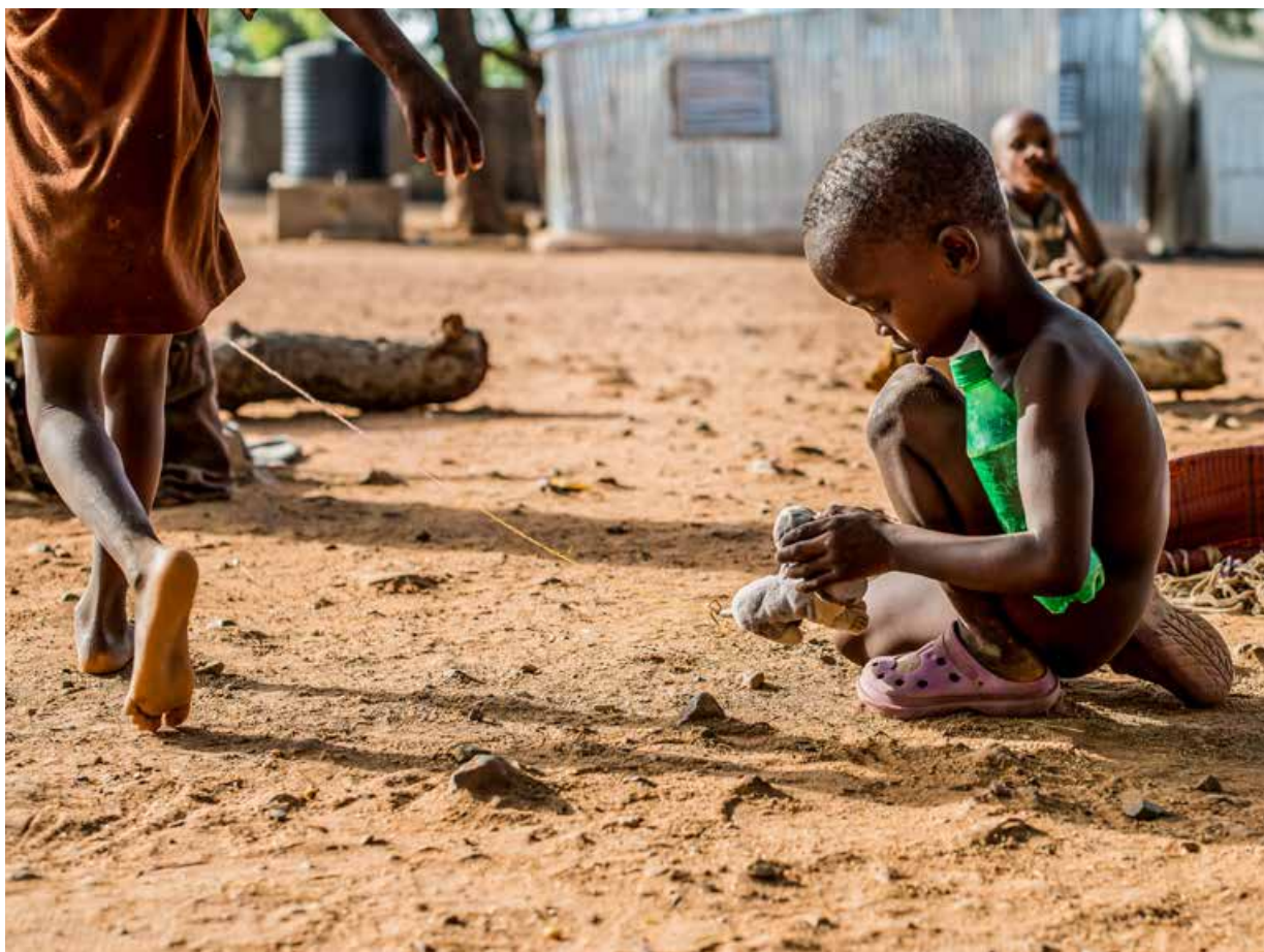
Child playing at St Theresa Catholic Church, Yola, Nigeria.

and curfews. Newly accessible areas in north-east Nigeria can only be accessed through the use of armed escorts, which makes it difficult for many humanitarian agencies to provide assistance as being associated with the military may put staff and beneficiaries at risk.