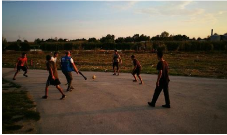
Playing football outside the RAP, Subotica (Serbia)@HCIT, 08 September 2016

The total number of asylum seekers in all locations in the North continues shrinking, now below 500. Of those, less than 200 were still camping in the open on Serbian soil close to the two Hungarian “transit zones” of Horgos I and Kelebija. Close to two-thirds were women and children from Afghanistan, Iraq or Syria. The SCRM sheltered another 274 migrants, mainly single men from Pakistan (120) or Afghanistan (80), in the Refugee Aid Point (RAP) of Subotica.