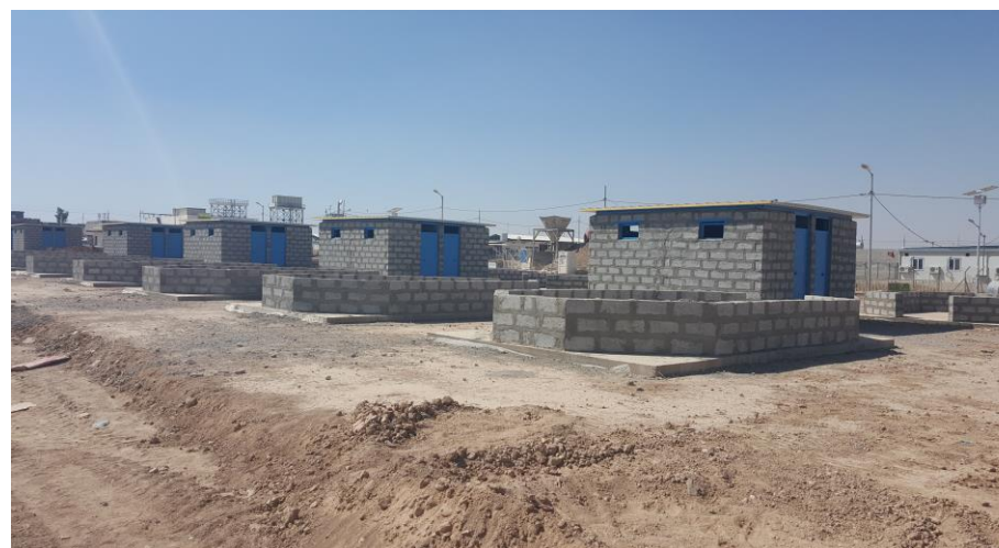
Shelter improvement works in Qushtapa camp, Erbil.

* Planned response is based on full funding of 3RP for an expected direct beneficiary population of 250,000 Syrian refugees and 1.5 million members of impacted local communities by end-2016. By 31 August 2016, 239,008 Syrian refugees (81,250 households) live in Iraq. 41 % = 98,049 live in 10 camps and 59 % =140,959 in non-camp/urban areas. 96 % = 230,530 live in Kurdistan Region-Iraq (KR-I): in