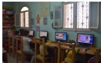
School Assessment, Bashaer Manaret Al-Yasmine, Obour City, July 3rd, 2016.

The Education Working Group continue to promote effective coordination through quality information management and a continuous collaboration with other sectors such as protection, health and water, sanitation and hygiene.