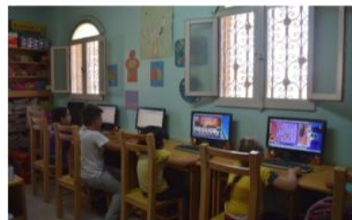
School Assessment, Bashaer Manaret Al-Yasmine, Obour City, July 3rd, 2016.

The Education Working Group continue to promote effective coordination through quality information management and a continuous collaboration with other sectors such as protection, health and water, sanitation and hygiene.