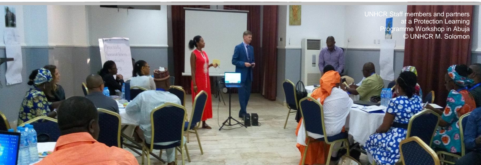
UNHCR Staff members and partners at a Protection Learning Programme Workshop in Abuja

He also indicated that an implementation plan has been mapped out including advocacy to religious, traditional and community leaders and other stakeholders.