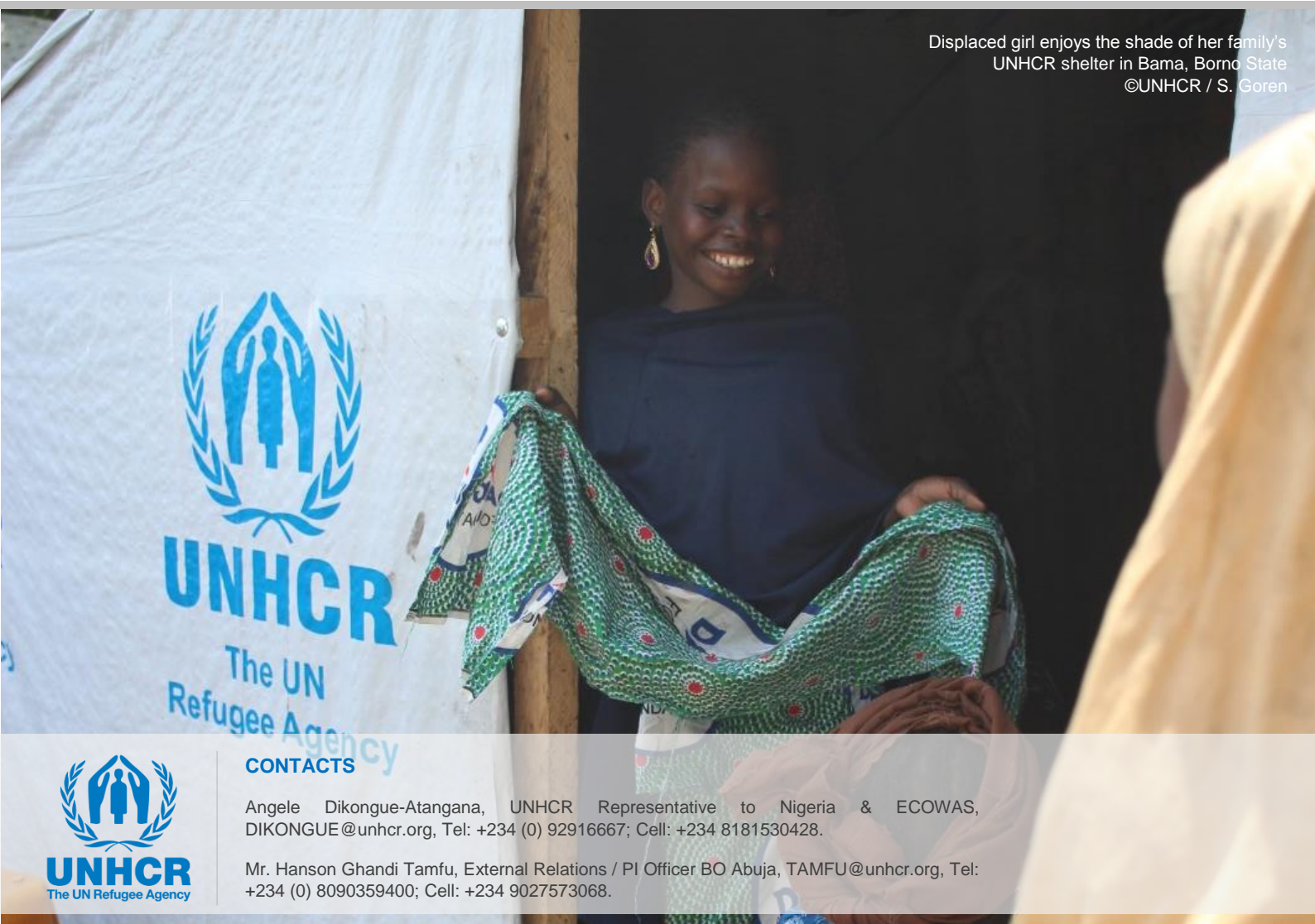
Displaced girl enjoys the shade of her family's UNHCR shelter in Bama, Borno State