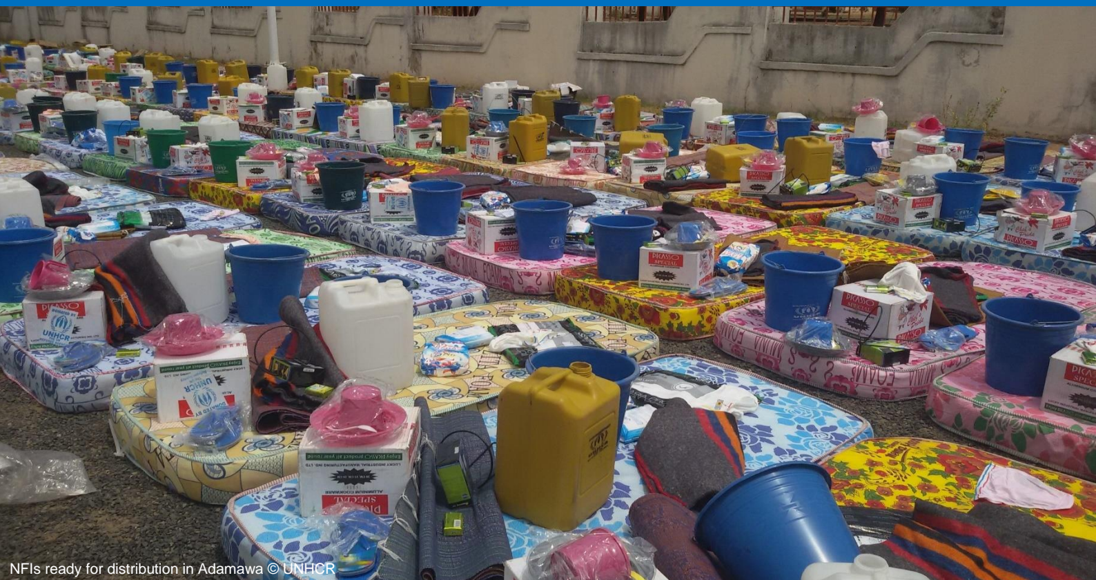
NFIs ready for distribution in Adamawa