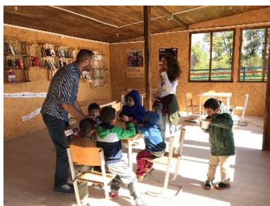
Children activities at Youth for Refugees facility, Presevo RC, (Serbia) 13 Oct 2016

The Presevo Reception Centre (RC) accommodated some 770 refugees and migrants. Over half of the RC population are from Afghanistan (55%), followed by those from Iraq (15%), Syria (12%) and Pakistan (12%). Some 42 % are children, 45% adult men and 13% adult women.