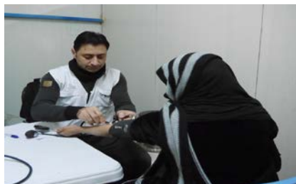
Taking vital signs in the triage room, Gawilan camp Primary Health Centre, Iraq

Access to reproductive health care services remains a key concern across the region with around four million women and girls of reproductive age assessed to be in need of special attention. Among children, improvement of health care services for newborns and need for routine immunization against vaccine-preventable illness remains a priority. The need for health and hygiene messaging is also a key focus area.