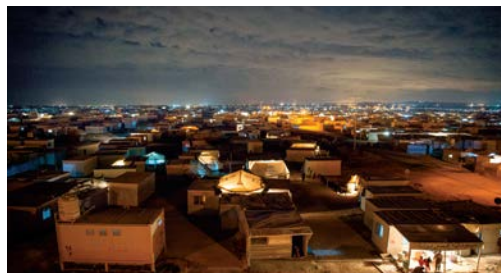
Zaatar camp by night.

Partners are working on addressing both the short- and longer-term shelter needs for the most vulnerable refugees and also those from the host communities. Studies have shown that there is a continuing increase in vulnerability which has impacted the refugees' ability to cover their shelter needs, particularly those in urban, peri-urban and rural settings.