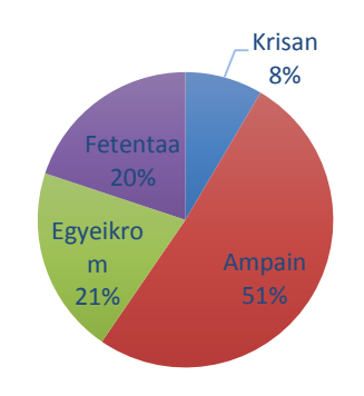
Figure 4: Population of concern | By Camp

<sup>1</sup> Accurate population figures will be available in mid-October 2016 after the ongoing Multipurpose Enhanced Registration Exercise (MERE). Fig 3 and Fig 4 above based on end of 2015 data.