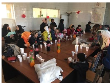
Celebrating arrival of a new born baby and birthday of his sister in Presevo RC (Serbia), 16 Nov 2016

In total, 849 refugees, asylum-seekers and migrants were accommodated in two Reception Centres: Presevo (699) and Bujanovac (150). Over 40% of residents of Presevo RC are from Afghanistan, 24% from Pakistan, 12% from Iraq, and 10% from Syria. Over 60% of residents of Bujanovac RC, which accommodates only families and unaccompanied and separated children, are from Afghanistan, 28% from Iraq and 6% from Syria.