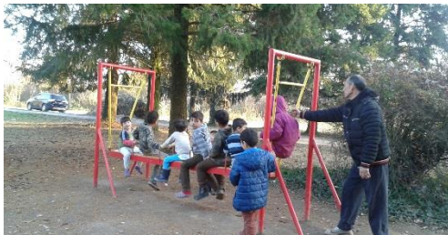
Refugee children playing in Principovac TC (Serbia), 19 November 2016

TCs in the West sheltered around 2,020 refugees and migrants: 1,035 in Adasevci, 580 in Sid, and 405 in Principovac.