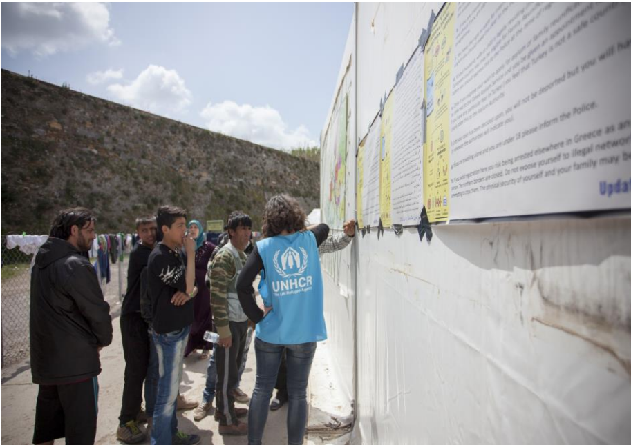
Chios Island, Souda Camp UNHCR staff giving information on refugees and migrants

During the reporting period two key issues have been discussed in the National WG: