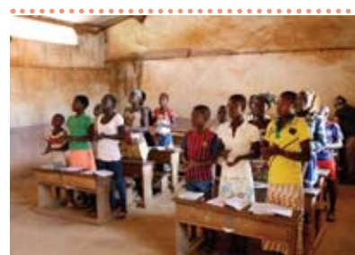
Students at a school in Bedobo, Eastern Cameroon. A large proportion (63 percent) of the population is under 25 years of age.

Politically, Cameroon is stable, but the situation is somewhat tenuous as the current president has been in power for more than 30 years, and there are restrictions of the freedoms of expression, association, and assembly.