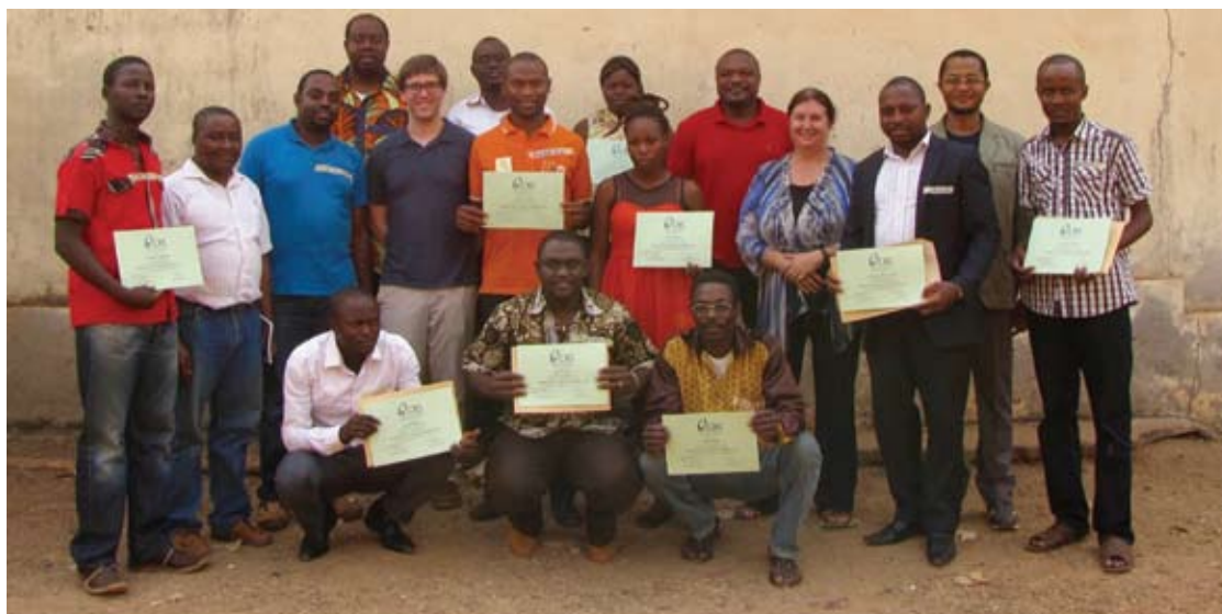
CRS/Cameroon SCA Team in Bertoua at the close of the debrief.