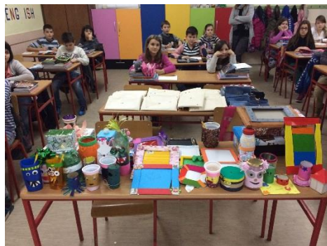
Refugee children visited a local school with gifts they made, Vranje (Serbia) @UNHCR, 25 December 2016

Over 1,070 refugees, asylum-seekers and migrants were accommodated in two Reception Centres (RC): Presevo (885) and Bujanovac (222). Some 46% of residents of Presevo RC are from Afghanistan, 30% from Iraq, 13% from Pakistan, and 8% from Syria. Residents of Bujanovac RC, which accommodates only families and unaccompanied and separated children, are from Iraq (38%), Syria (32%) and Afghanistan (20%), with 12% others.