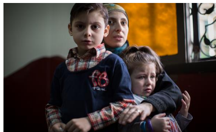
Syrian woman with her children attending an awareness session

Since April 2016, Egypt's Vulnerability Assessment for Refugees (EVAR) collected data from 17462 households (78002 individuals), comprising approximately 66% of the total Syrian refugee population registered with UNHCR in Egypt. In Egypt, 94% of Syrian refugees are unable to meet the minimum expenditure for their families, with 61% of households (66% of individuals) being severely vulnerable and a further 29% of households (28% of individuals) being highly vulnerable. Expenditure on food represents the largest proportion (45%) of overall spending. Rising food prices have the greatest impact on more vulnerable households, for whom food represents a larger proportion of expenditure. Rent is the next largest expenditure overall (28%). The majority of households identified their most important unmet need as additional support for rent or improved shelter. Health represents the third largest expense (5% of overall expenditure), followed by education-related costs (2%). Amongst the Syrian re-assessed refugees, 55% of individuals received food vouchers and 39% received cash assistance. A significant increase on the cash assistance beneficiaries is noted as beneficiaries within the cash assistance were prioritized for the EVAR phase. Despite the cash and food assistance provided, 48% of the households assessed up to date, needed to borrow money or purchase on credit in the last month in order to meet their basic needs.