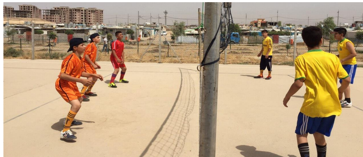
Syrian Refugee Students in education sport activity