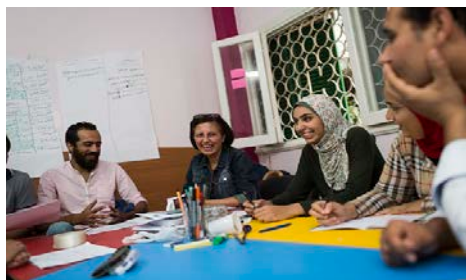
Workshop on livelihoods activities in Egypt.

UNHCR in Egypt also continues to assess Syrian refugees' vulnerability. Since April, a total of 61,755 individuals were assessed in Cairo, Alexandria and Damietta.