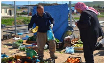
Fruits and vegetable market in Basimira Refugee Camp, Iraq.

3RP partners are working together with the private sector and national Governments to determine how best to create livelihood opportunities for women and men that fill gaps within labour markets and contribute to the establishment of new enterprises, rather than fostering competition for jobs and driving down wages.