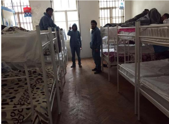
Refugee boys and men relocated from city centre enjoying the facilities in Obrenovac (Serbia), 20 January 2017

UNHCR and partners assisted with food and non-food items, medical services, counselling, interpretation, referrals and recreational activities. Community leaders are engaged in various every day responsibilities ensuring community participation in the management of the RC. Upon request of authorities, UNHCR and partners continued to support the Centre for Social Work in conducting Best Interest Assessments for unaccompanied and separated children.