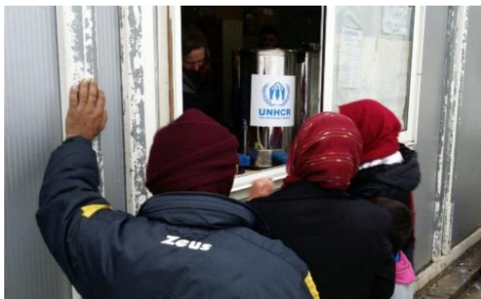
Refugees and migrants waiting for their hot tea in Vathy RIC.