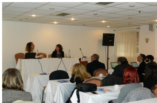
Conference for lawyers and judicial actors.