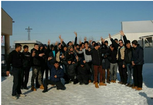
Participants of the Youth Corner, Adasevci Transit Centre (Serbia) UNHCR @01 February 2017

Transit Centres (TCs) in the West sheltered 2,046 refugees and migrants: 1,027 in Adasevci, 648 in Sid and 371 in Principovac.