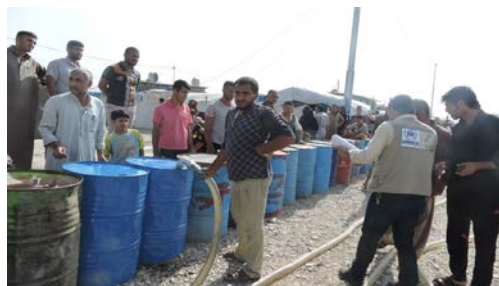
Kerosene distribution inside Arbat Refugee Camp - Sulaymaniyah Governorate.

Across the region, this assistance was critical in helping Syrians face the many difficulties created by harsh weather conditions, including freezing temperatures, snow storms, torrential rain and flooding. Planning is underway for the 2016/2017 winterization activities, and predictable funding is required to ensure that the winter response can be implemented as efficiently as possible.