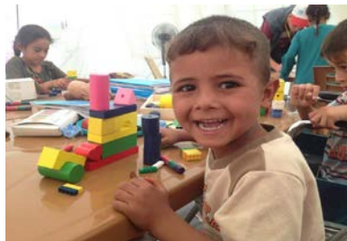
Students during Sport Activities in Dahuk Governorate, August 2016.

Strengthening education systems is a core component of the refugee education response as it allows education systems to better respond to the increased needs of Syrian and host communities children.