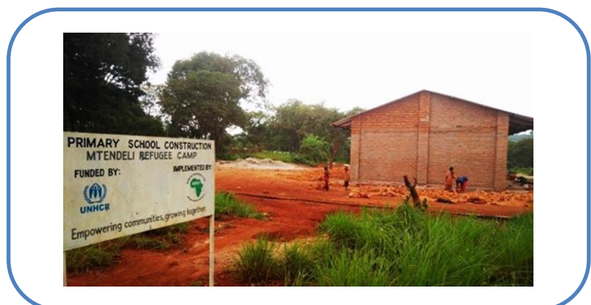
School Construction Site in Mtendeli Camp where construction is nearly finalized by AIRD

Classrooms Construction: The construction of class rooms is currently ongoing across all camps. Out of the total targeted number of 97 classrooms, 50 class rooms are under construction in Nyarugusu Camp, 18 class rooms in Mtendeli Camp and 29 class rooms in Nduta Camp. Over 43 percent of class rooms construction activities have now reached the walls construction stage.