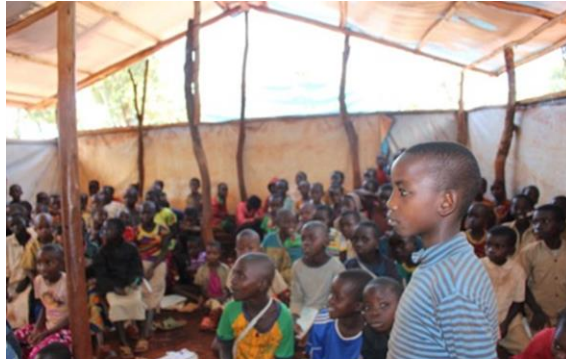
Burundian students studying under a TLS in Nyarugusu Camp

the Shelter Sector Working Group, seek for alternatives that can be pursued for further discussions in addressing the pressing need of class rooms.