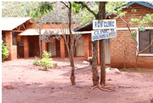
The Reproductive and Child Health (RCH) Clinic at the Tanzanian Red Cross Society's (TRCS) Hospital in Nyarugusu Camp -