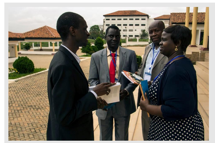
Professors during workshop in Accra, Ghana

Regional – West Africa. UNHCR in collaboration with the University of Ghana organized a training for Law Professors and Lecturers to assist in developing expertise on the issue of statelessness and right to a nationality and to encourage research in these fields. The 5-day training was designed to provide a bigger picture on statelessness issues in Africa and to push participants to consider how their work can help address these questions. A total of 30 participants from 13 different African countries took part in the activity. They adopted a communiqué whereby they commit to teach, conduct research and carry out advocacy/sensitization activities in the field of statelessness.