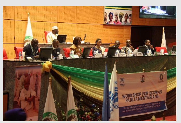
Representatives of ECOWAS and UNHCR discuss the 2016/2017 joint action plan at ECOWAS Parliament in Abuja - Nigeria

In October, UNHCR and the ECOWAS Parliament jointly organized a workshop in Abuja, Nigeria on the role of Parliamentarians in addressing the challenges associated with Statelessness in West Africa. As a result of the workshop, the ECOWAS Parliament and UNHCR signed a Memorandum of Understanding whereby they commit to conduct joint mission to sensitise member States on the importance of accession and implementation of the statelessness conventions