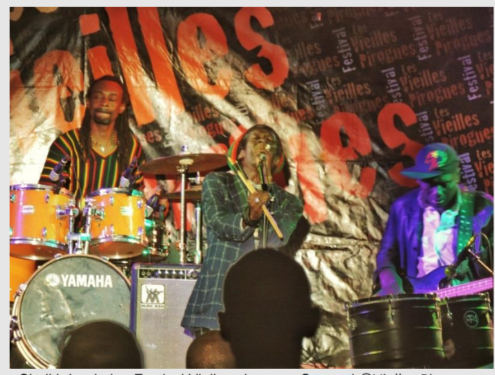
Cheikh Lo during Festival Vielles pirogues. Senegal

In Ghana , the campaign was supported by actress Ama K. Abebrese, who recorded a very inspiring message underlining the injustice of statelessness, available <u>here</u>.