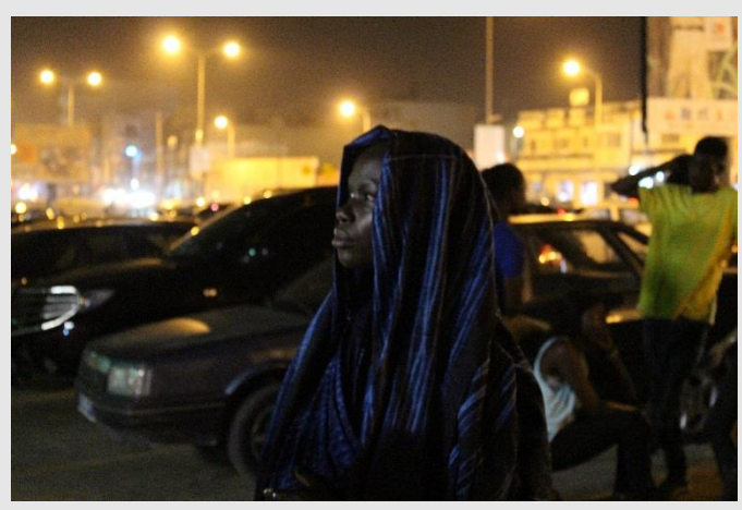
Actress during video-recording of 'Invisibility'

"Because we cannot live without rights and because we want to exist, we have the right to a nationality". This phrase captures the spirit of the video 'Invisibility' produced by UNHCR to celebrate the 2<sup>nd</sup> anniversary of #IBelong campaign. The video was shown on Senegalese TV and giant screens in Senegal and Togo. Watch the video <a href="https://example.com/here">here</a> and join the celebration!