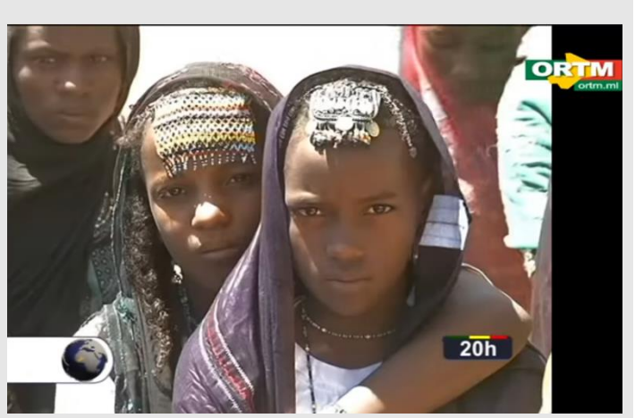
News covering the celebration in Mali