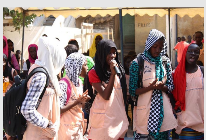
Students singing songs on statelessness. Dakar, Senegal