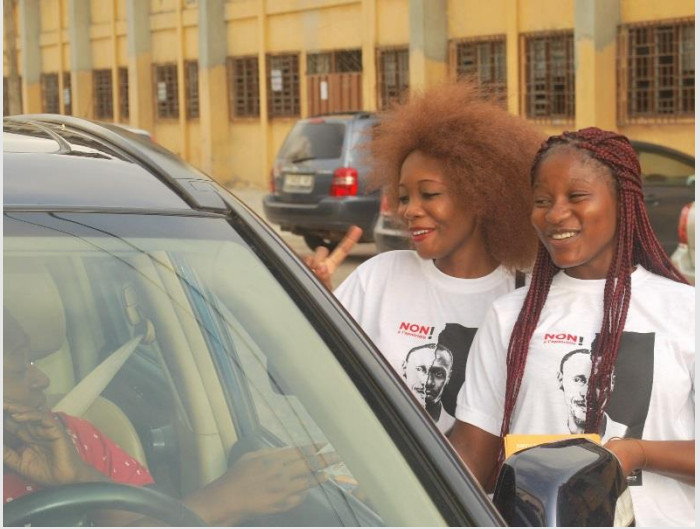
Sensitization of the general public in Benin