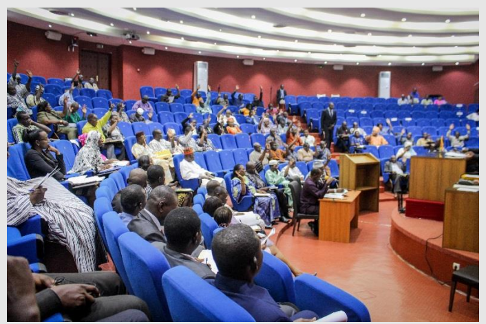
Vote at Parliament in Burkina Faso

On 18 October 2016, the members of the Parliament of Burkina Faso adopted a bill on the accession to the 1961 Convention on the Reduction of Statelessness, marking a major step forward in the fight against statelessness. At international level and officially, Burkina Faso will be party to the 1961 convention after depositing the instruments of accession to the Secretary-General via the Office of Legal Affairs of the United Nations in New York. Meanwhile, much remains to be done on the ground with regard to the identification and reduction of the risk of statelessness among affected communities.