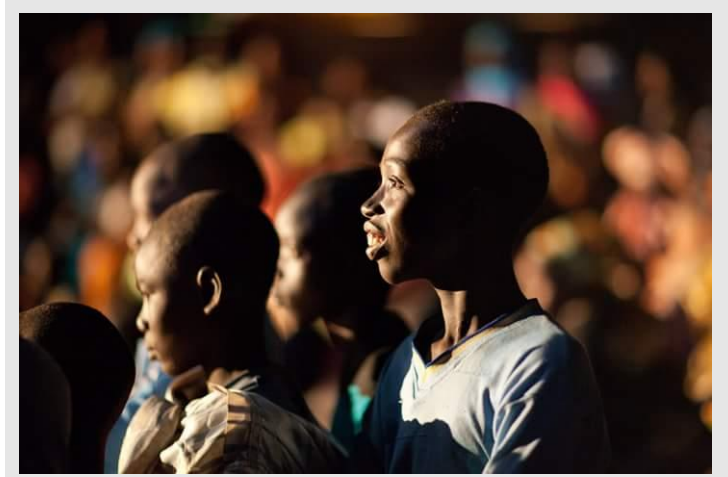
Children watch videos during Afrikabok festival - Senegal

For two weeks in November, the Afrikabok travelling cinema festival crossed 10 regions of Senegal to entertain and raise awareness on statelessness. In addition to screening videos on the theme, the organization distributed informative comic books. Learn more Festival Afrikabok <a href="here">here</a>.