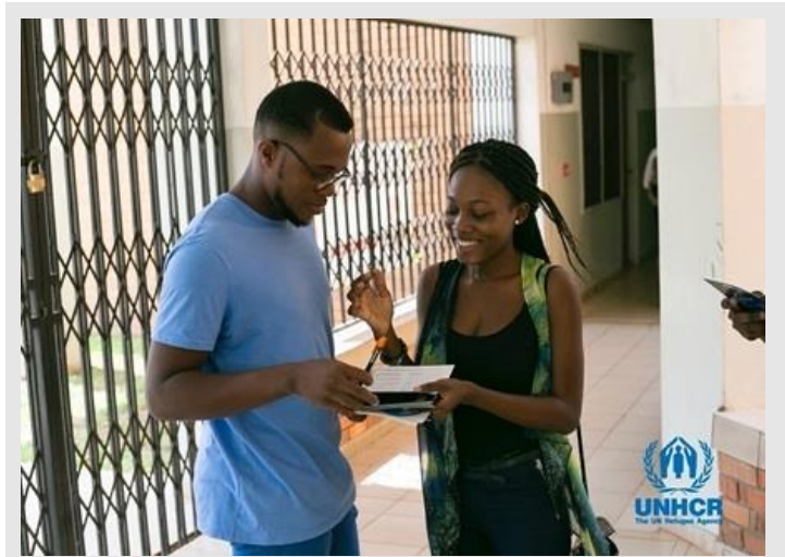
A student is invited to sign the #IBelong campaign at University of Ghana

In Ghana , a two-day sensitisation campaign was conducted at the University of Ghana and Ashesi University where UNHCR assisted in organizing a sign-up event for the #IBelong campaign. Over 500 petitions - both hardcopies and online- were signed over the two days. A video on the event is available <a href="here">here</a>.