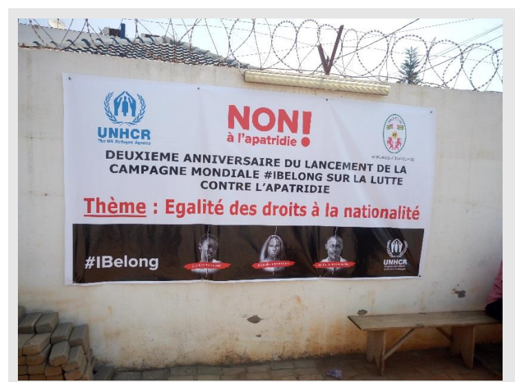
Poster with information on the campaign in Lomé, Togo

In Togo , UNHCR took part in a TV debate with the Director of Nationality and an academic. A short video on statelessness was also broadcast several times on national television and information posters displayed in different parts of Lomé.