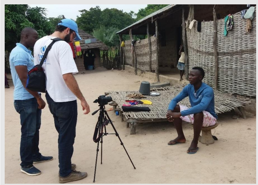
A young man gives his testimony on documentation, Guinea Bissau

In January 2017, UNHCR will launch #1minute1million social media campaign to raise awareness on statelessness across West Africa. People from different countries in region will be sharing their experiences and challenges related to documentation.