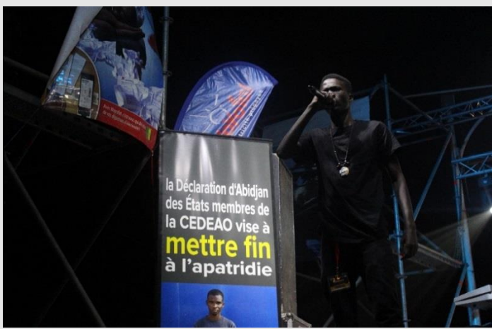
Rappers during Gediawaye by rap festival, Senegal @G.hip-hop