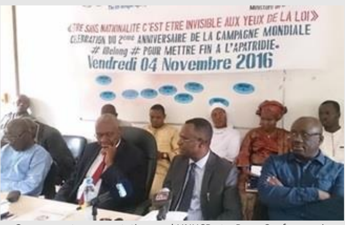
Government representatives and UNHCR at a Press Conference in Guinea