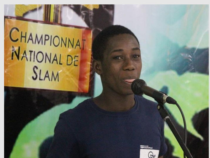
Slammer during competition. Côte d'Ivoire