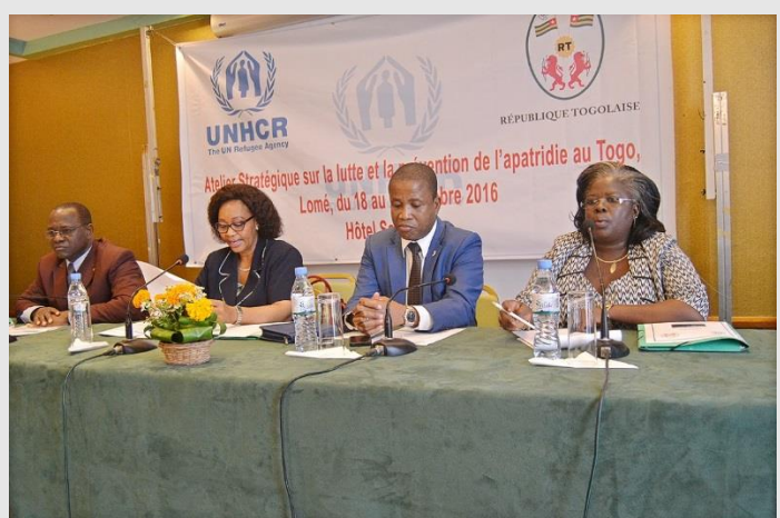
Workshop on statelessness in Lomé, Togo