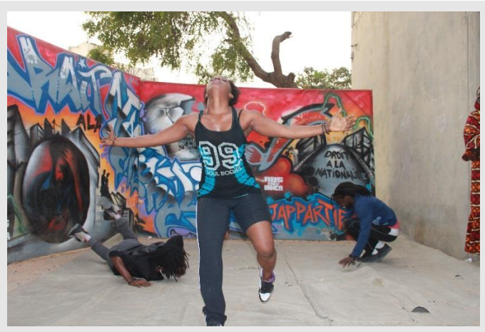
Dance performance in Yeumbeul Nord, Dakar

Dancers and artists performed themed performances dealing with statelessness, while students role-played with the audience to raise awareness about statelessness and its consequences.