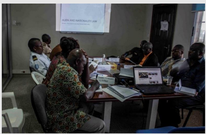
Stakeholders workshop, Monrovia, Liberia