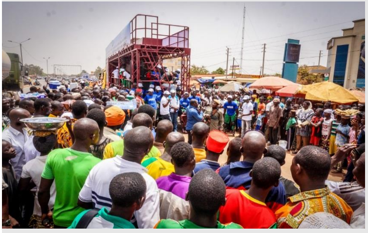
Role-playing in Ouagadougou, Burkina Faso