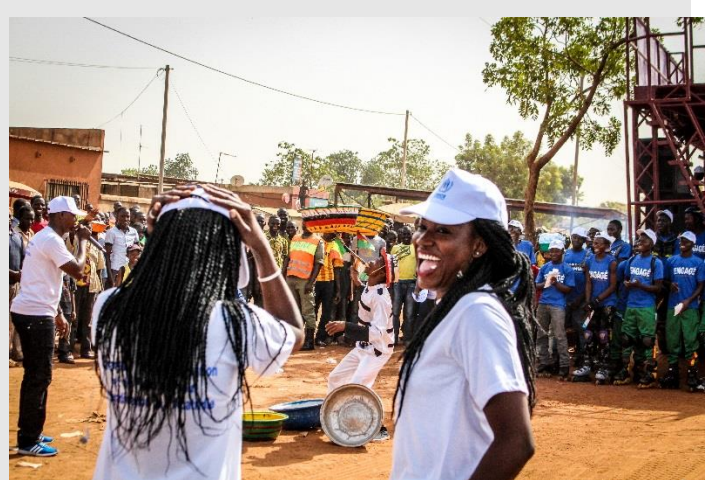
Ouagadougou, Burkina Faso