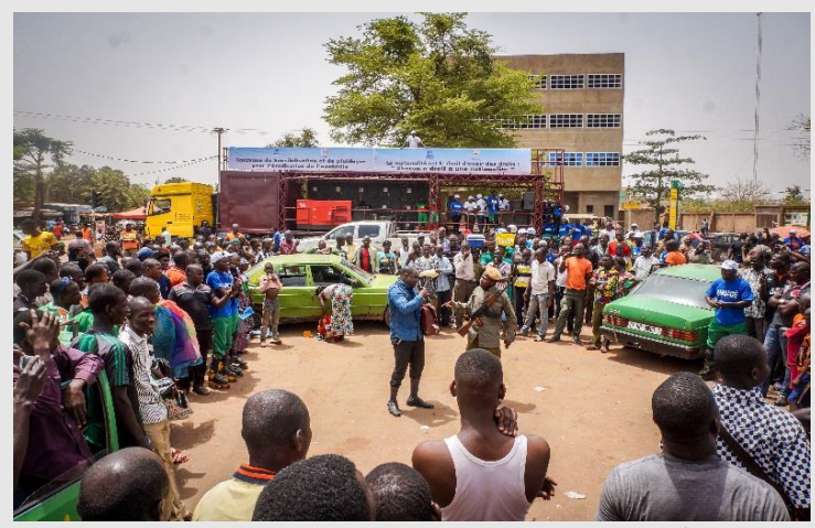
Role-playing in Ouagadougou, Burkina Faso