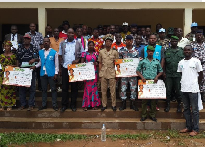
Workshop on Statelessness, Grabo, Côte d'Ivoire