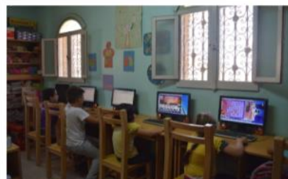
School Assessment, Bashaer Manaret Al-Yasmine, Obour City, July 3rd, 2016.

The Education Working Group continue to promote effective coordination through quality information management and a continuous collaboration with other sectors such as protection, health and water, sanitation and hygiene.