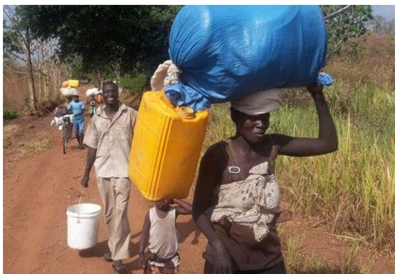
Refugee arriving in Meri site from border with South Soudan @UNHCR