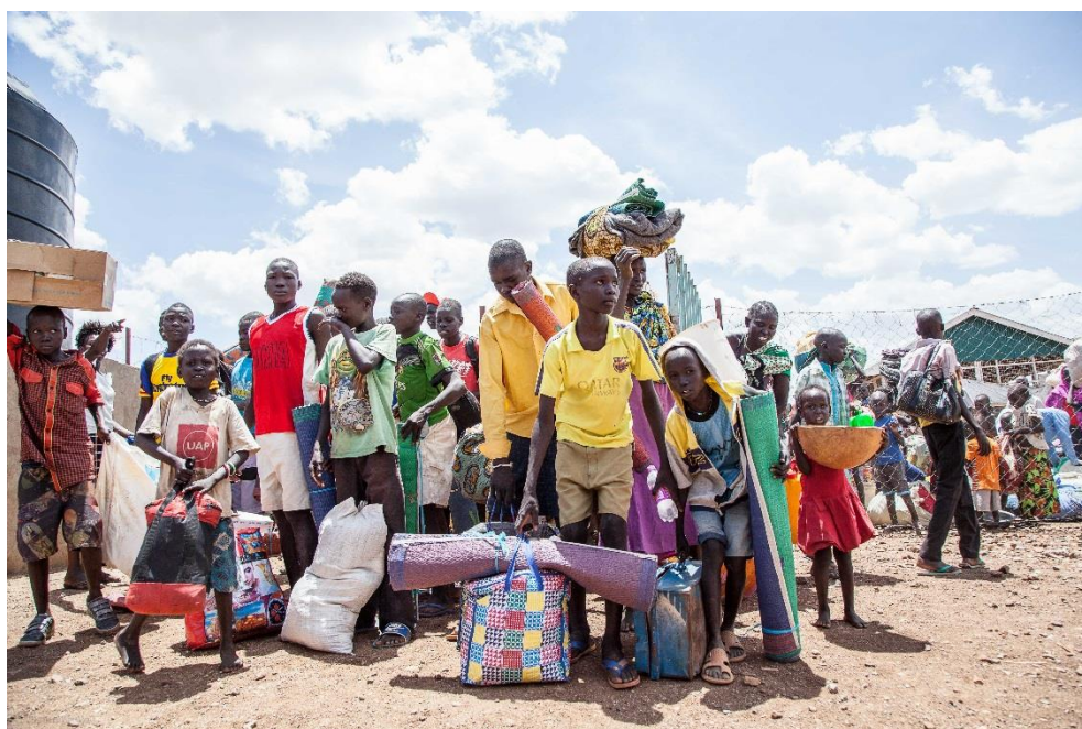
PHOTO: New arrival South Sudanese refugees at Nadapal Transit Centre prepare to board a UNHCR vehicle to Kakuma refugee camp.