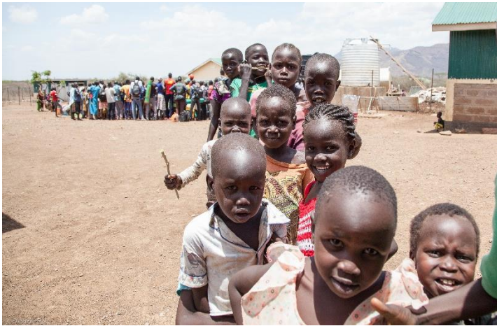
PHOTO: New arrival children pose for a photo at Nadapal transit Centre