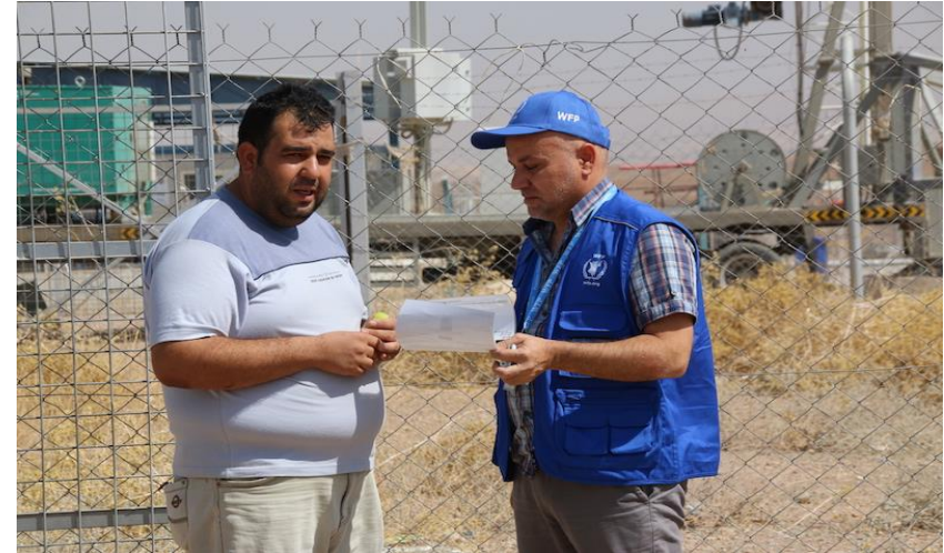
A WFP field monitor speaks with a refugee in Darashakran camp.

WFP Iraq has a revised net funding requirement for project PRRO 200987.IQ of USD 6.9 million from February 2017 until July 2017.