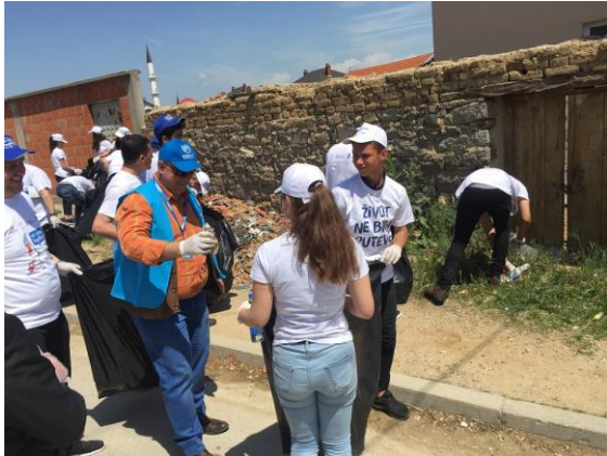
Cleaning of Miratovac village, Miratovac (Serbia), ©UNHCR, 4 May 2017

520 refugees and migrants were accommodated in four Reception Centres: 209 in Pirot, 209 in Divljana, 57 in Dimitrovgrad and 45 in Bosilegrad. Most are from Iraq, followed by Afghanistan and Syria and around half are children.