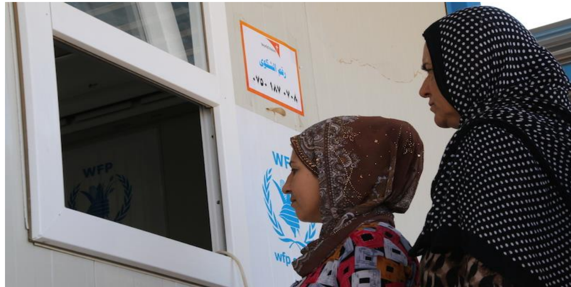
Syrian refugees request information and share concerns in Darashakran camp.

Monitoring of prices at retailer shops was carried out in various camps throughout the March cycle. All prices were found to be appropriate.