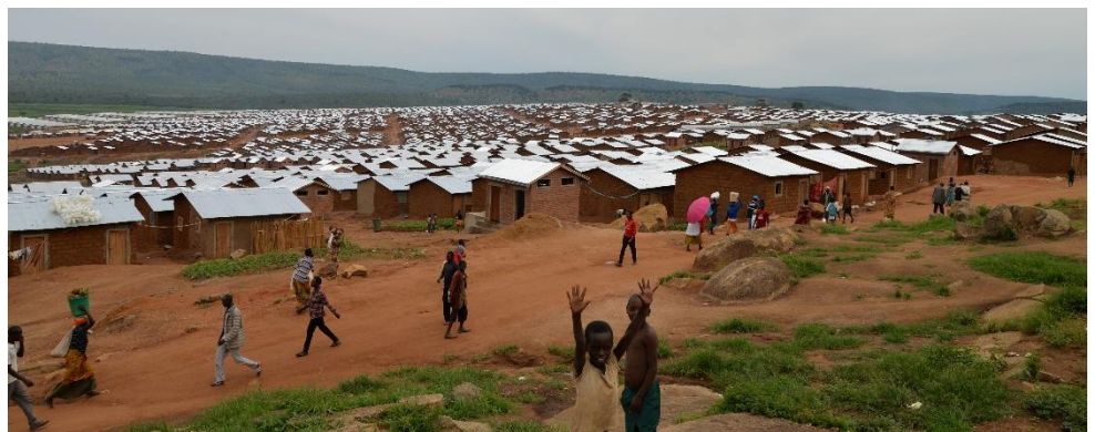
Collaboration between Government of Rwanda and UN Refugee Agency has turned Mahama refugee settlement into a model town two years since opening.