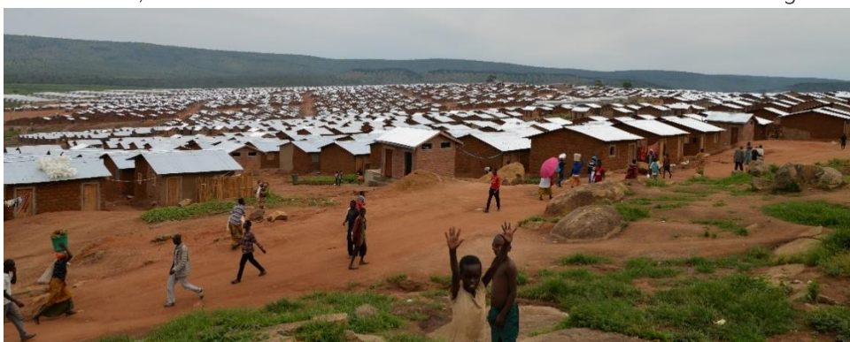
View of semi-permanent shelters in Mahama Camp. The camp continues to grow in order to accommodate new arrivals from Burundi.