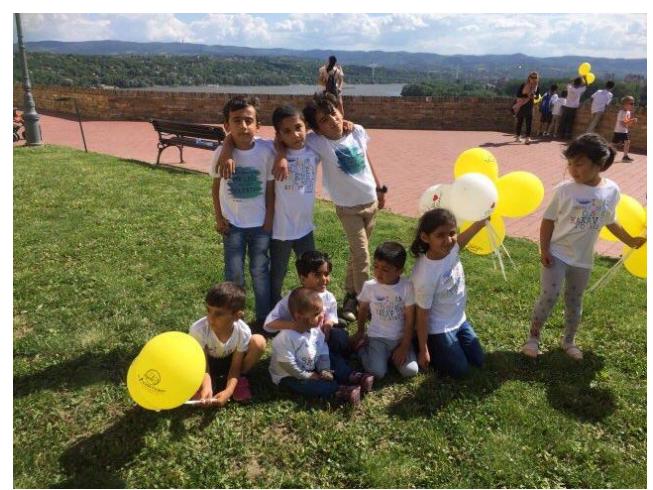
Refugee children from Krnjaca AC participated in Baby Exit Festival, Novi Sad (Serbia), 27 May 2017

Majority of the residents of Presevo RC are from Afghanistan (56%) and Iraq (29%), and 48% are children. In Bujanovac, which continues to accommodate only families with children and UASCs, majority are from Iraq (48%) and from Syria (29%), while 60% are children.