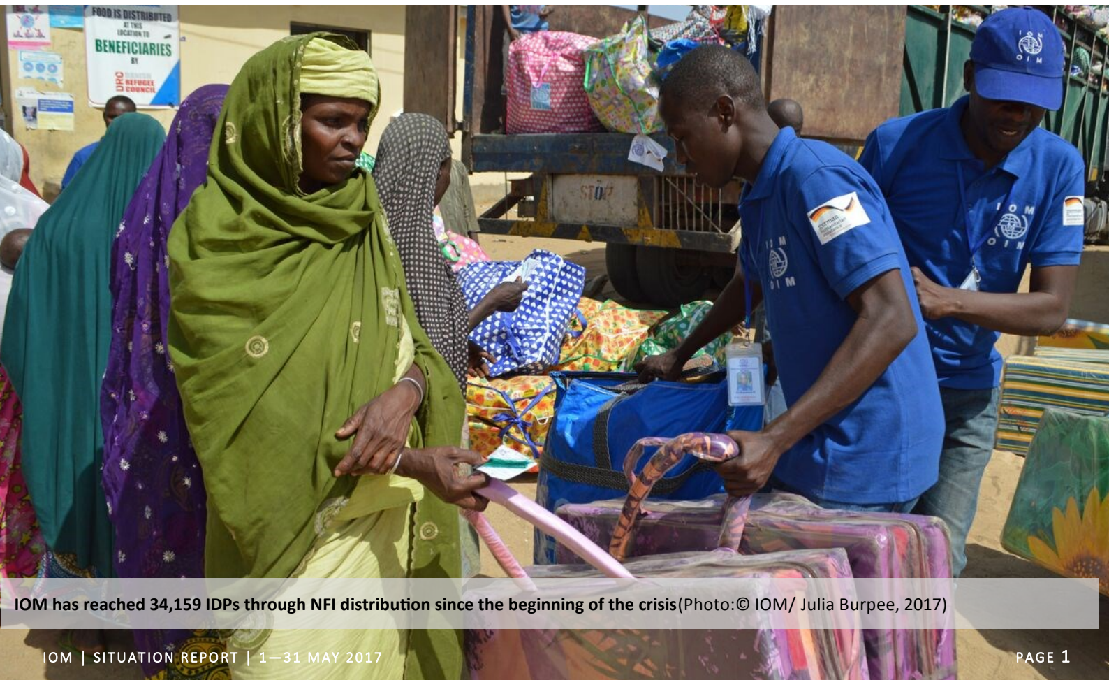
IOM has reached 34,159 IDPs through NFI distribution since the beginning of the crisis

IOM provided psychosocial support to 26,244 individuals through their usual activities. A training on knitting was carried out in 10 camps in Maiduguri as part of IOM's livelihood support.