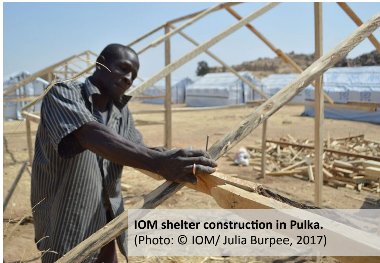
IOM shelter construction in Pulka.