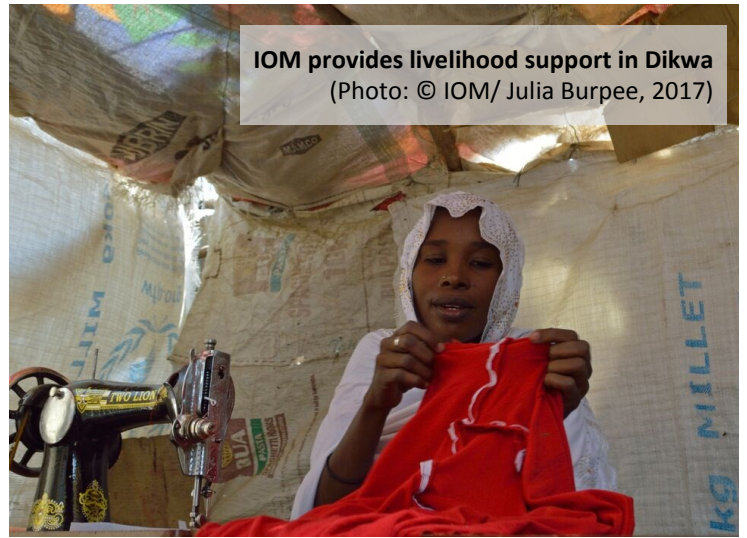
IOM provides livelihood support in Dikwa