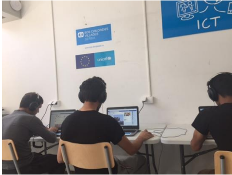
ICT Corner, Obrenovac TC (Serbia), 4 July 2017