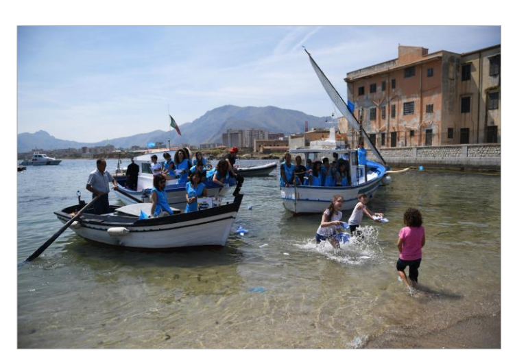
Italian Coastguard, children, volunteers and officials take part in a symbolic rescue of paper boats to send a message to the G7 leaders to take action to safeguard children on the move off a beach in Palermo, Italy, on Thursday, May 25, 2017. The paper boats made by school children as a symbol of the fragility and unseaworthiness of the vessels that thousands of children are forced to board in their journeys across the Mediterranean contain special messages from young people across Italy.

In June, UNICEF also finalized the joint process with UNHCR and IRC on the Roadmap for action to improve the situation of refugee and migrant children arriving and staying in Europe without their parents or care givers. The final Roadmap document and an accompanying Call for Action were <u>launched</u> during a press briefing in Geneva. The Roadmap highlights the need to identify children, register them through child-friendly procedures, and build a relationship of trust with them as early as possible. Ensuring that a well-trained guardian takes immediate responsibility for the child, engaging cultural mediators, and mobilizing members of host communities are critical measures that can help build a trusting relationship and protect children from smugglers, traffickers or family pressure. The concrete