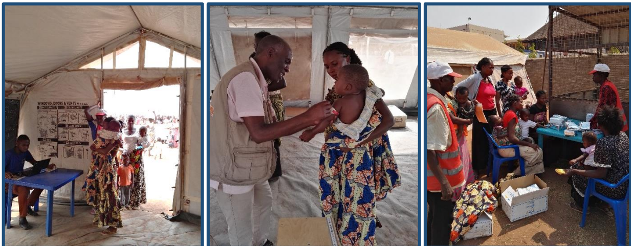
Photos: Distribution in Cacanda Reception Center.

In addition, the mothers of infants aged < 6 months were encouraged to continue breastfeeding and return when the child is 6 months old.