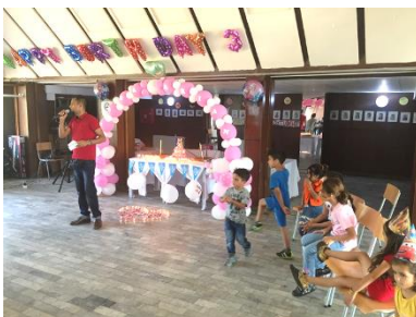
Birthday party for a three year old child in Presevo RC (Serbia), @UNHCR, 7 Aug 2017

627 refugees, asylum-seekers and migrants were accommodated in the three Reception Centres of Presevo (405), Vranje (132) and Bujanovac (90), including 63 unaccompanied and separated children (UASC).