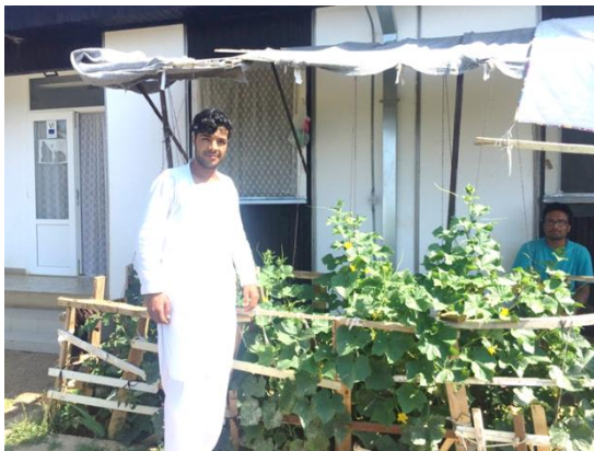
Young Afghan man growing cucumbers and tomatoes in his small patch, Pirot RC (Serbia), ©UNHCR, 18 August 2017

721 male refugees/migrants (including 130 unaccompanied or separated boys) were sheltered in Obrenovac. Most are from Afghanistan, followed by Pakistan and very few from Iraq or other countries. The Centre for Social Work, supported by UNHCR and partners, performed nine systematic best interest assessments for UASCs in Obrenovac.