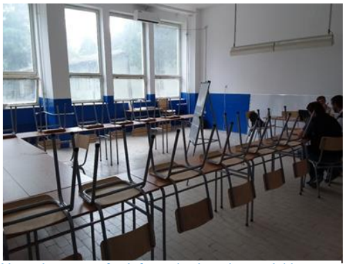
New classroom for informal education activities, Obrenovac TC (Serbia) @UNHCR, 28 August 2017

Most residents of Presevo RC are from Afghanistan (52%) and Iraq (33%), and 45% are children. In Bujanovac, most are from Iraq (34%), Syria (27%) and Afghanistan (28%) while 61% are children. Vranje RC accommodates families and UASCs. All its residents are from Afghanistan, and some 52% are children.