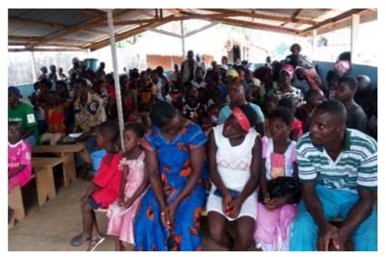
After crossing the Cavalla River, refugees from Little Wlebo Camp (LWC) are welcomed by UNHCR and partners.