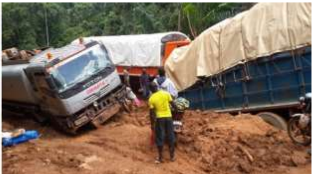
The Zwedru-Monrovia highway (left) and the road between Zwedru and Fish Tow (right) were affected by heavy rains.

• On 02-04 May 2017, a high-level delegation visited Harper and Zwedru to meet with refugees, local authorities and partners. The delegation was comprised of the Deputy Special Representative of the Secretary General (DSRSG) and Resident Coordinator of UN in Liberia; UNHCR Liberia Representative; UNMIL Chief of Civil Affairs; WFP Cote d'Ivoire (CDI) Representative; FAO Representative; and UNDP Representative. Refugees were presented with several examples of reintegration projects in Cote d'Ivoire and Ivorians that have successfully reintegrated, as well as the return package provided by WFP to returnees.