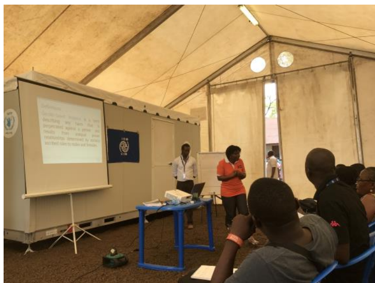
UNFPA Expert on GBV session at CCCM introductory training on CCCM IOM 2017