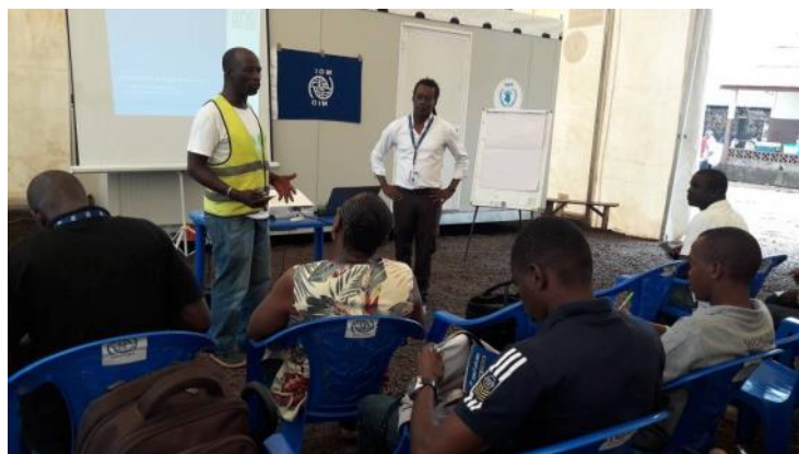
ONS Camp Manager welcoming participants to CCCM training in Juba Barrack transit site IOM 2017