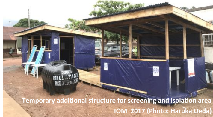
Temporary additional structure for screening and isolation area IOM 2017

In coordination with the Ministry of Health and Sanitation and Health Pillar and based on the health assessment conducted at Juba Barrack transit site, IOM constructed the temporary screening and isolation area at the health facility. This is aimed for supporting the clinic's capacity to meet the increased needs on health in the area, serving both the affected population and the host community.