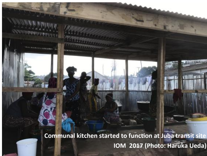
Communal kitchen started to function at Juba transit site IOM 2017

IOM will continue supporting the Government of Sierra Leone through CCCM and Shelter technical support and capacity building on CCCM including those agencies involved as service providers in the transit sites.