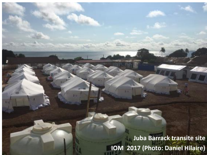
Juba Barrack transit site IOM 2017

At Juba Barrack transit site, 50 tents donated by JICA to the Government of Sierra Leone were installed with floor pallets by IOM. Initiated by the Government of Sierra Leone, affected households has started to move to the site from 6 September onwards. As of 11 September, all 50 tents are occupied. The government is undertaking a verification exercise in the site to capture the issues around overcrowding.