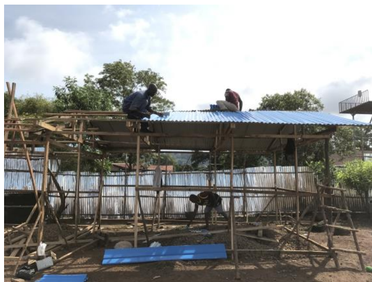
A shaded area being constructed at Juba transit site IOM 2017