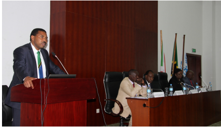
Hon. Mwigulu Nchemba, Minister of Home Affairs addressing the delegates at the 19 th Tripartite Commission Meeting on 31 August 2017