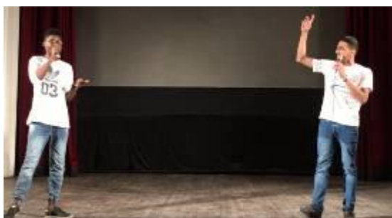
Nabd El-Sharee band is singing for hope to a cheering audience.