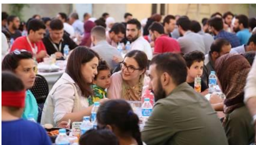
Syrian actress Kinda Aloush breaks fast with refugees on World Refugee Day

World Refugee Day 2017 took place during the Muslim fasting month of Ramadan. A World Refugee Day Iftar (breaking the fast) for refugee families was held at Fard Foundation in Cairo in collaboration with UNHCR. Children and parents learned about the culture of other refugee groups through different activities including storytelling, musical performances, and painting workshops, as well as presentations of traditional dresses and decoration. Syrian, Sudanese and Yemeni women participated in a cooking competition coached and judged by Egyptian celebrity chefs, including Wesam Masoud and Moustafa El Refaey, and Syrian actress Kinda Alloush.