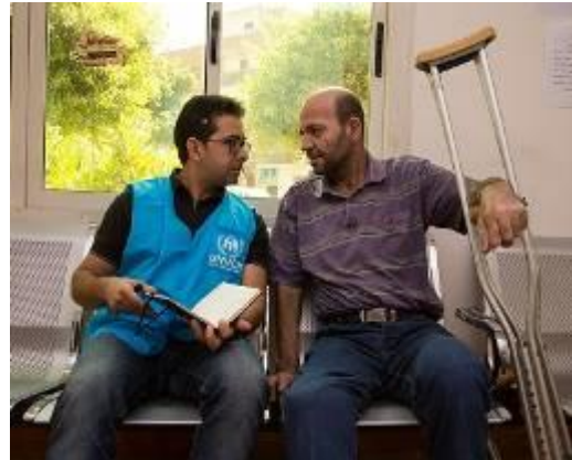
UNHCR staff member and Syrian refugee at a clinic in Cairo