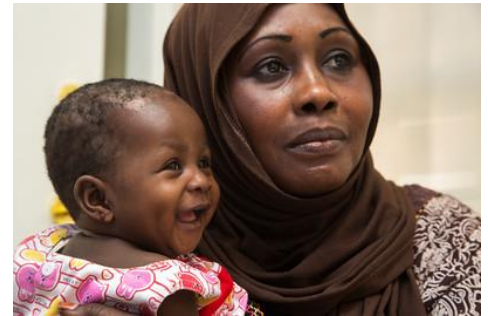
Sudanese mother and daughter.

As of end of April, a total of 204,767 refugees and asylum-seekers of 63 different nationalities are registered with UNHCR in Egypt . While refugees are dispersed throughout Egypt, including in remote areas, the majority are concentrated in three urban areas, namely Greater Cairo, Alexandria and Damietta.