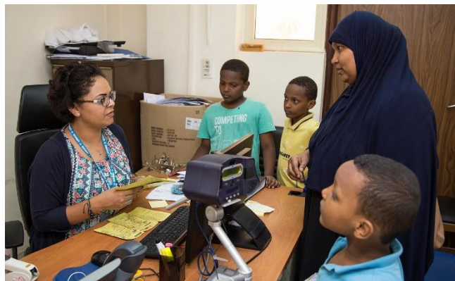
Family during registration process.