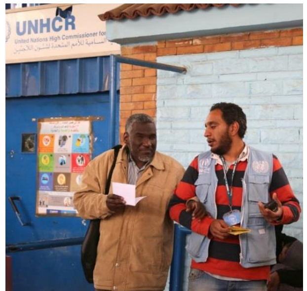
UNHCR staff helps an old man to sit inside the UNHCR office in 6th of October city.