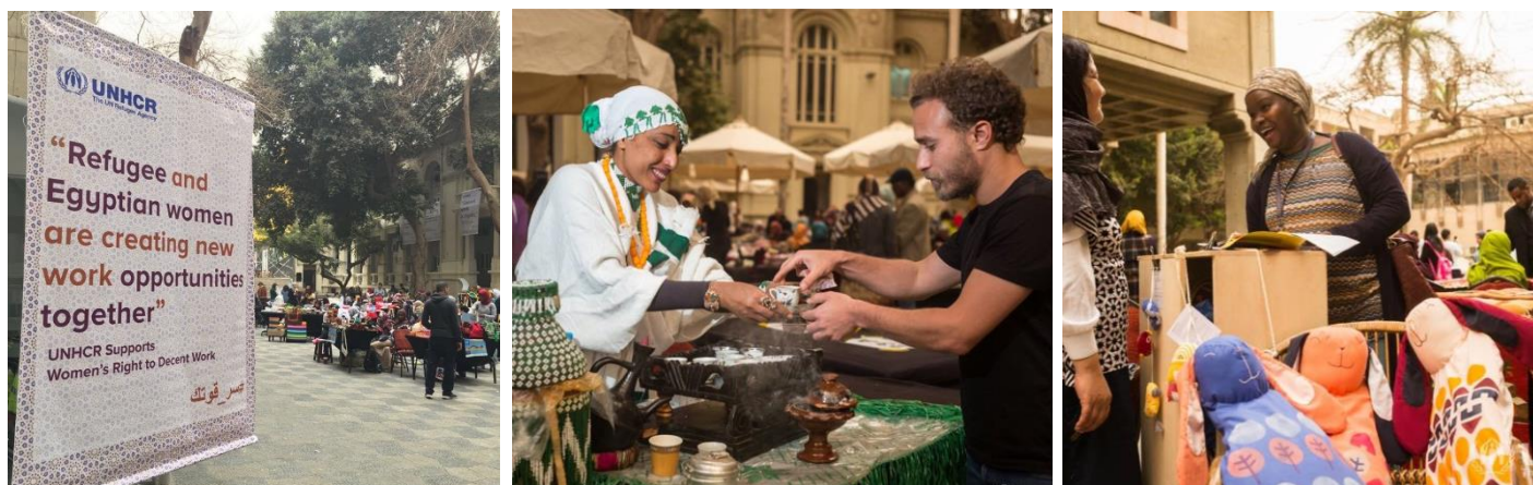
Vendors and visitors during the business fair for refugee and Egyptian women.